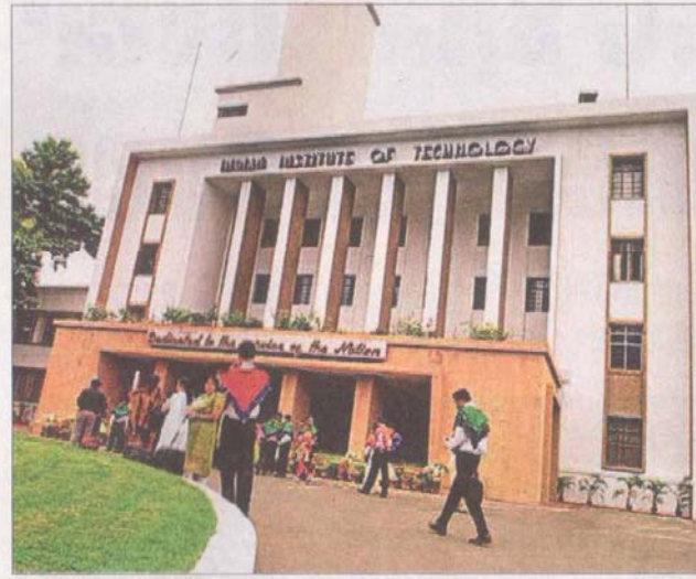
Other Indian institutions among the top 200 are IIT Madras, IIT Delhi and University of Delhi

IIT Kharagpur has been ranked among the peers such as Georgetown University, Lancaster University, Pennsylvania State University, Queensland University of Technology, University of Illinois, Chicago and University of Liverpool, it added.